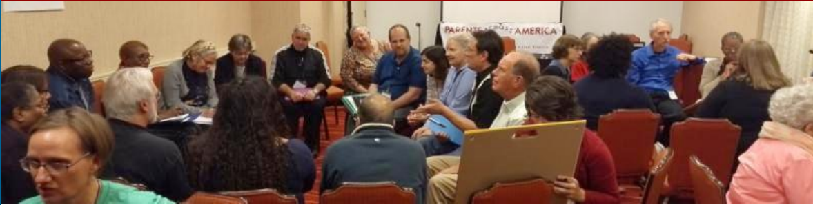
Lively discussion at PAA's NPE session

Website About PAA What We Believe News Room Gift Store